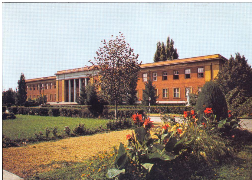
Martfű, socialist new town