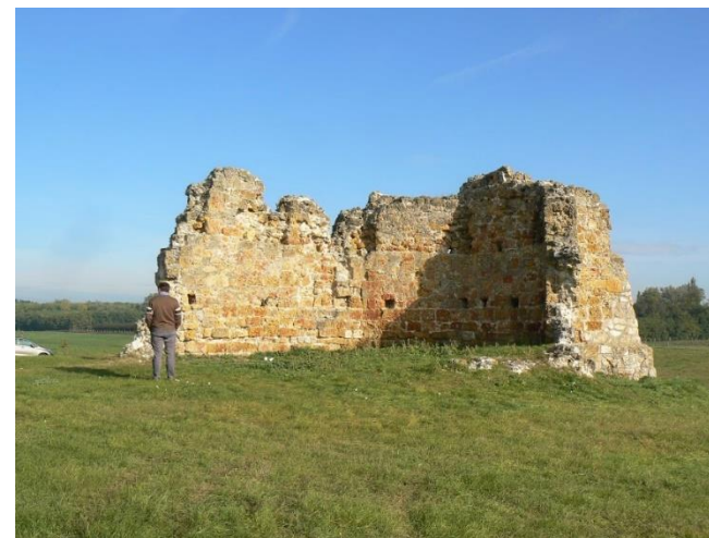
Lajosmizse: the ruined church of Mizse