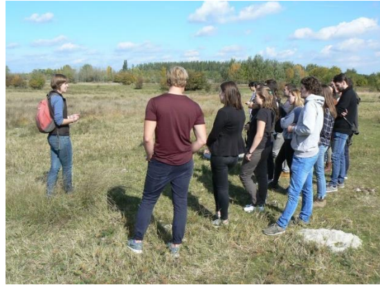
Szappan-szék , saline lake in Kiskunság