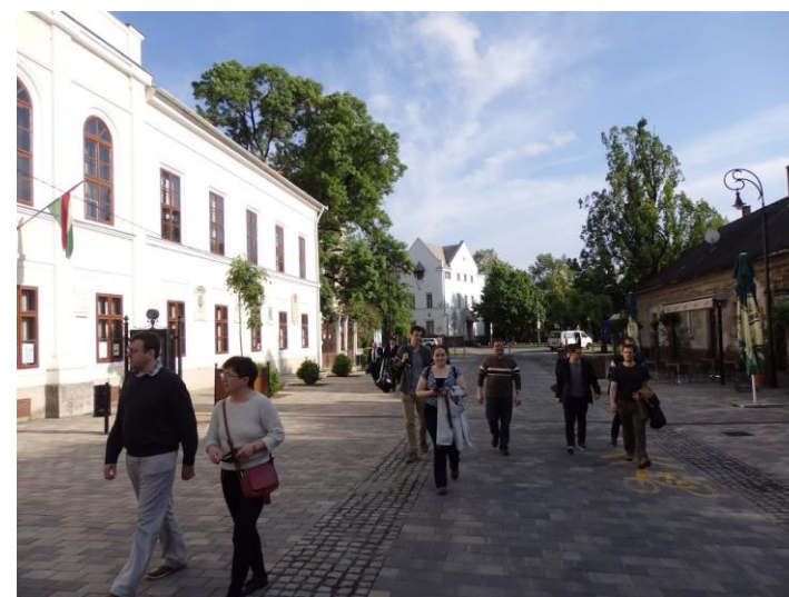
Szarvas, 19th century Slovak settlement