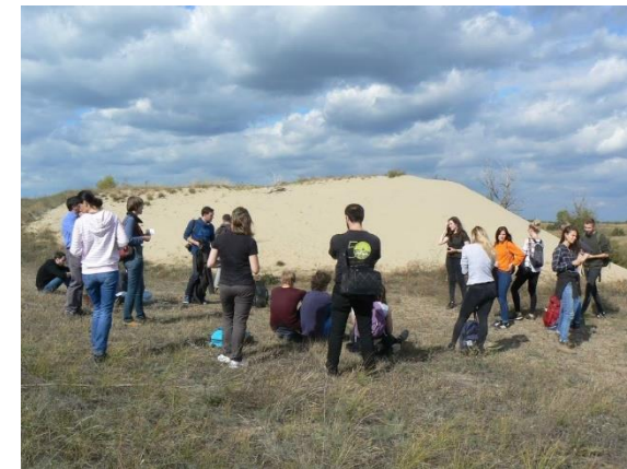
Fülöpháza : shifting sand dunes in Kiskunság